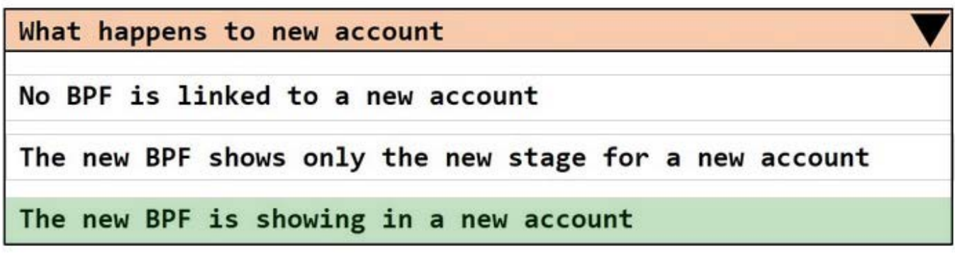
Box 1: Existing accounts show the new BPF.

When an entity record is being created and if there are multiple BPFs defined on that entity. The system would do the following: