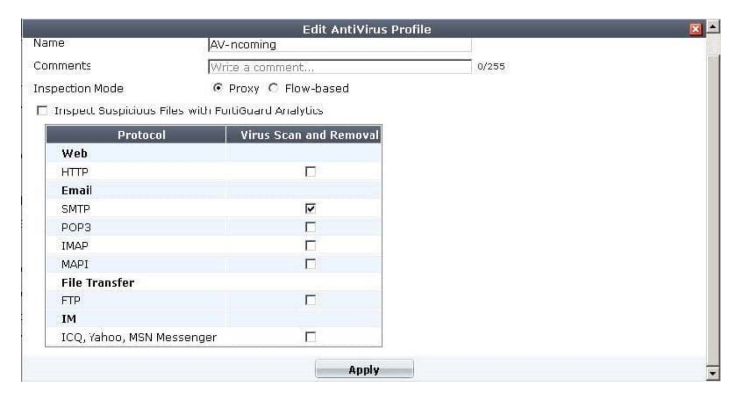
Exhibit A: Exhibit B:

A firewall policy has been configured for the internal email server to receive email from external parties through SMTP. Exhibits A and B show the antivirus and email filter profiles applied to this policy.