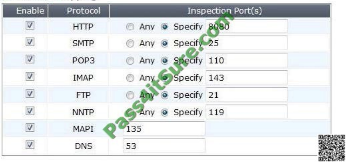
Exhibit C DLP Profile: Which of one the following profiles could be enabled in order to prevent the file from passing through the FortiGate device over HTTP on the standard port for that protocol?