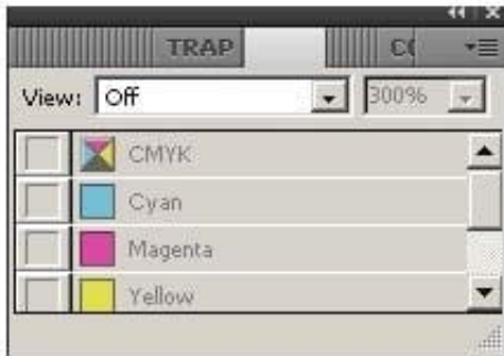
Separations Preview panel

can be seen how blending, transparency, and overprinting will appear in color separated output. The Separations Preview panel can be displayed by choosing Window > Out put > Separations Preview or pressing Shift+F6.