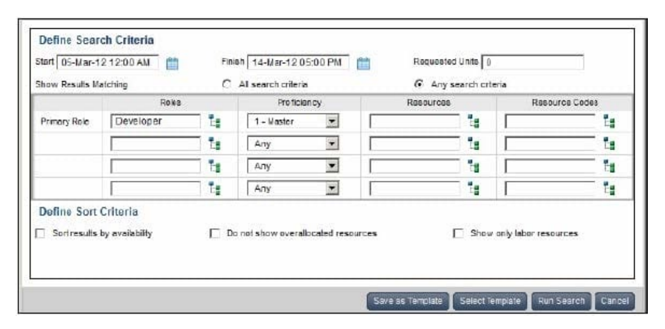
Note 2: A resource skill level is a resource\\'s role proficiency.

For example, in the following screenshot we are searching for all resources with Developer as the Primary Role with Proficiency of Master